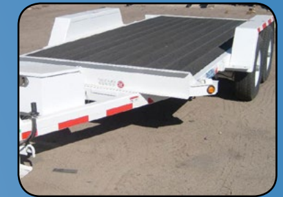
Rumber ® Deck