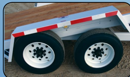
Heavy Duty Bolt-on Fenders