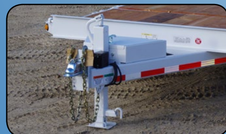
Bolt-On Coupler & Jack Assembly