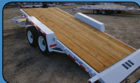
82 1/2" Deck Width Full Length of Tiltbed