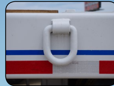
Extra D Rings