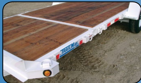
Combination D-rings & Stake Pockets