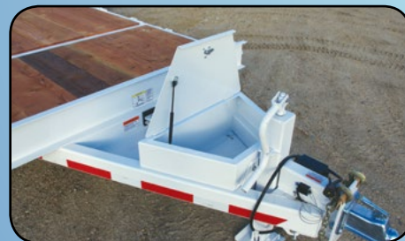
Combination Lockable & Open Storage Compartments