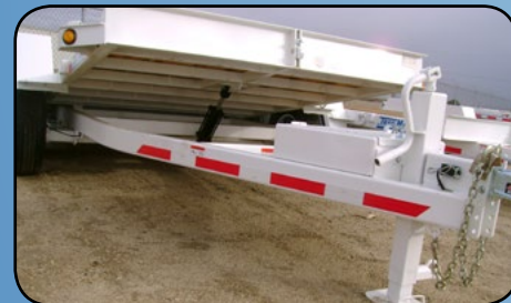
1-Piece Continuous Sub Frame