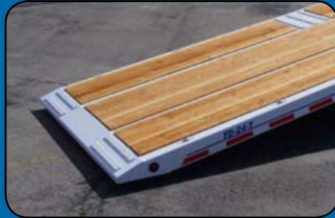
Traction Bars on Tail & Wheel Well Covers