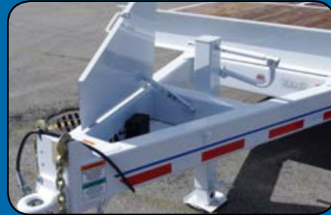
Lockable Storage Compartment in Tongue Area