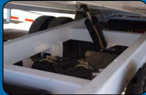
Cushion Cylinder for Load/Unload Control