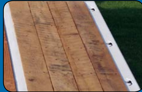
Stake Pocket/Chain Slot Provide Diverse Load Securement Options