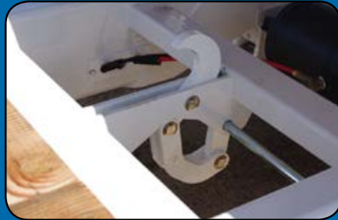
Adjustable Over-Center Type Latch Assembly