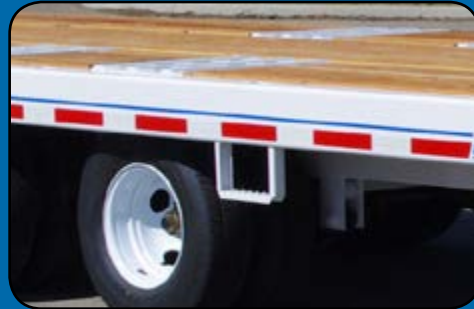
Step for Easy Access on and off the Trailer Deck